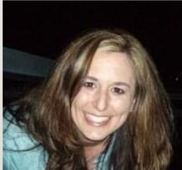
Vice Chancellor, Human Resources State Center CCD