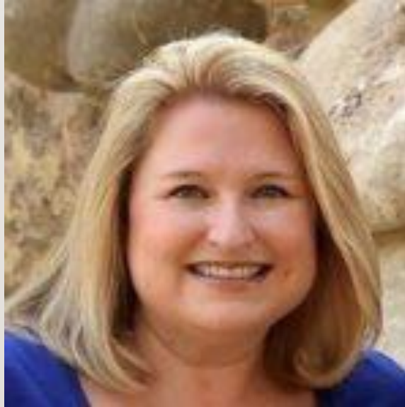
Deputy Chancellor Santa Clarita CCD