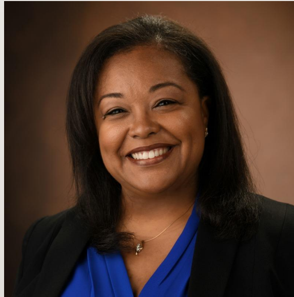
Associate Vice President, Human Resources and Training & Development Napa Valley College