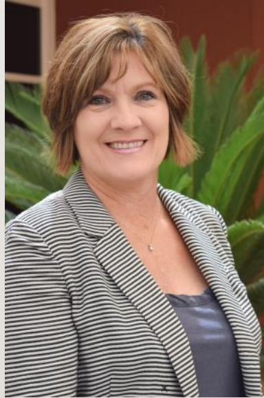
Chief Human Resources Officer Mt. San Jacinto College